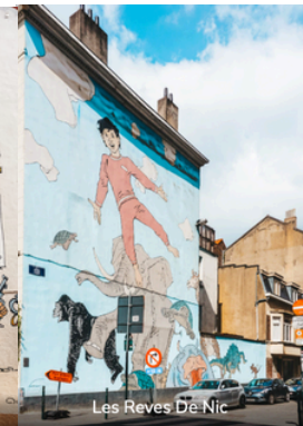
Les Reves De Nic