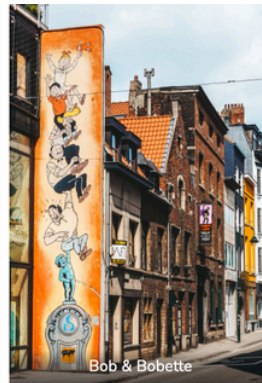
Bob & Bobette