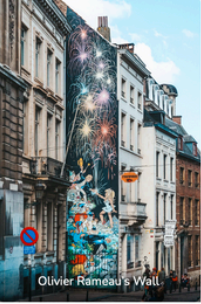
Olivier Rameau's Wall

Here are a few of the most famous and interesting ones: