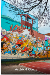
Astérix & Obélix