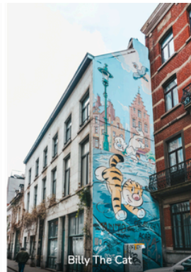
Billy The Cat